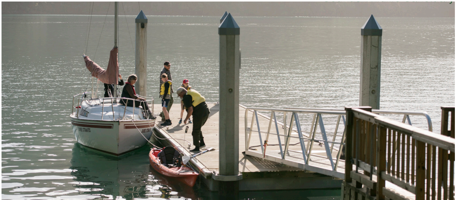
Above: The Sanctuary is still busy even in the middle of winter, this image was taken during the July school holidays.